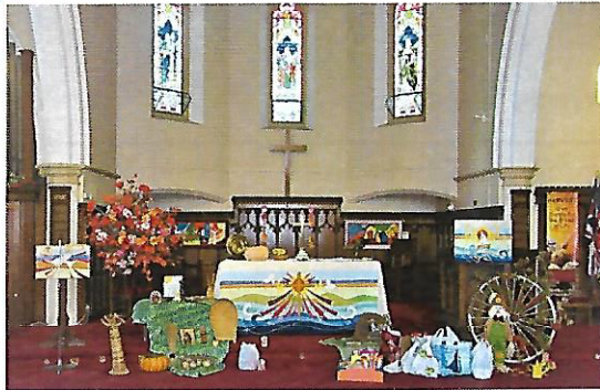
Harvest Display at Finchley Methodist Church

May they inspire us a Circuit and local churches to be more fruitful.